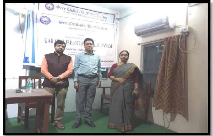
1. Our resource person presenting his speech with board work 2. Resource person with our Principal Sir & Coordinator Mam