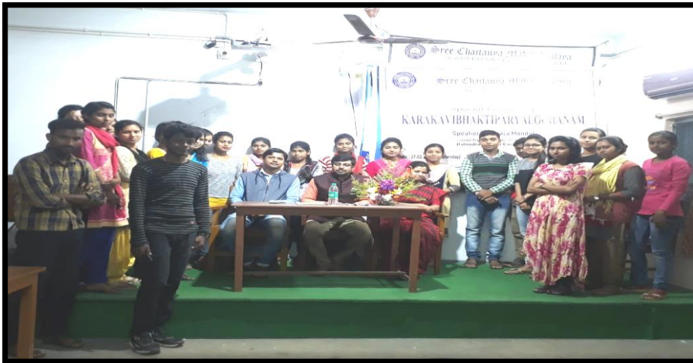
3. Both of the teachers & students together in one frame after the lecture.